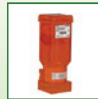
64 TALL CANISTERS 660 CC