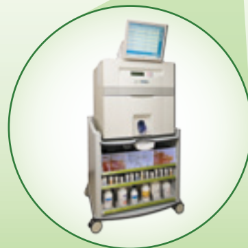
CONVENIENTLY PLACE ON A CART