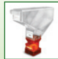
6 SUPER CELL CANISTERS 2200 CC