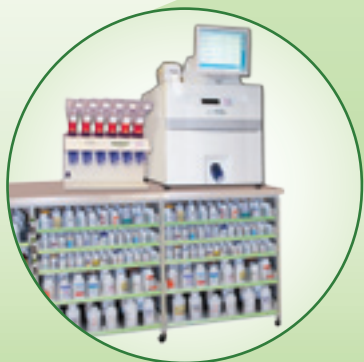
USE ON AN EXISTING COUNTERTOP