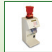
AVF-1 for recalibrations and quality control testing