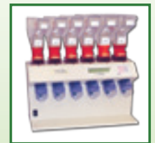
AVF-6 for direct fill needs