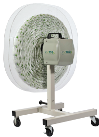
Automatic Spooler for ATP ® 2 Series