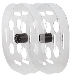
AdherePac ™ 16.5" Acrylic Spool